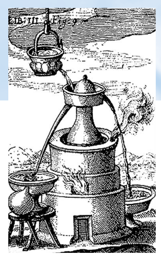
Alambic with water cooling around the distillation helmet.

In the developmental history of distillation equipment, this unconventional model disposes of a cooling basin shaped like an oriental turban.