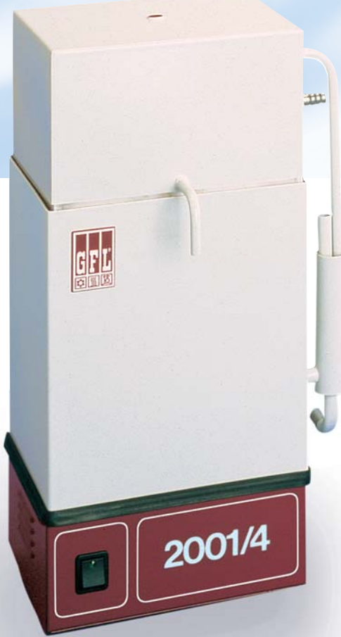
2001/4 Mono Water Still 4 I / h, for bench mounting

Their easy handling makes them an indispensable help in producing high-quality distillate.