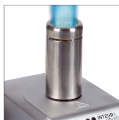
Long burner head