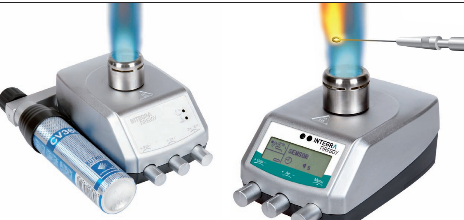
FIREBOY Safety Bunsen Burner